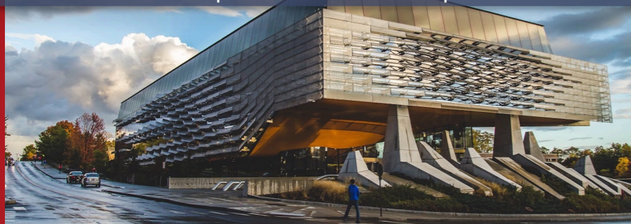
One Department: Two Campuses. Ithaca and New York City

A two-semester professional degree program designed to enhance practical skills. Flexible requirements make it possible to realize a broad range of CS-related career possibilities.